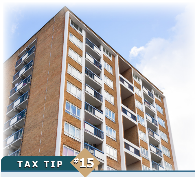
A 1031 Tax Deferred Real Estate Exchange postpones the payment of Federal Taxes until the property is actually sold.

If you are a real estate investor or builder, you can reduce your tax bill with the low-income housing tax credit. This annual credit applies to your qualified new low-income housing construction costs. The credit is granted for ten consecutive years. Some or all of it can be taken against tax on any type of income, and the unused credit can be carried forward or carried back. For Federally subsidized construction, and for existing housing acquisition, there is a similar credit. The Tax Cuts and Jobs Act lowered the corporate tax rate from 35 to 21 percent, which impacts pricing for the housing credit and affordable housing production, but did retain the credit.