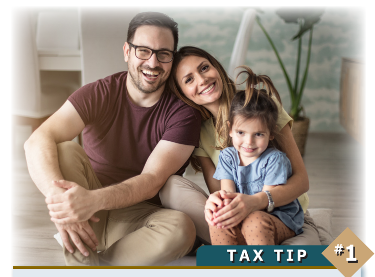
A good strategy for minimizing your AMT liability is to keep your adjusted gross income (AGI) as low as possible. We can help you do that.

Those who adopt a child can receive a tax credit of up to $14,440 for qualified adoption expenses in 2021, subject to income limitations (see page 11). Those adopting a child with special needs may claim a $14,440 tax credit in the year the adoption is completed, even if they do not have qualified adoption expenses.