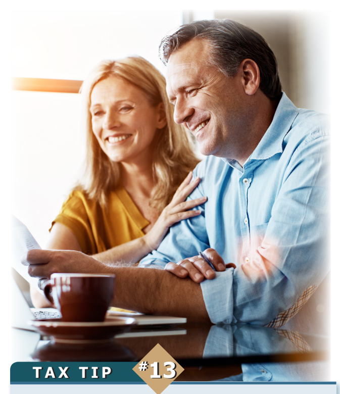
Try to hold on to stocks for at least a year if you have a gain. The short-term capital gains tax may have you paying more.

Always review gains and losses before the end of the year so you can offset gains and make sure you have paid enough in estimated taxes.