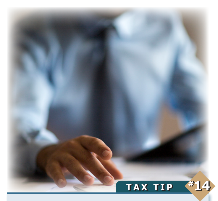
Delay late-year mutual fund investments until after the fund's dividend date.