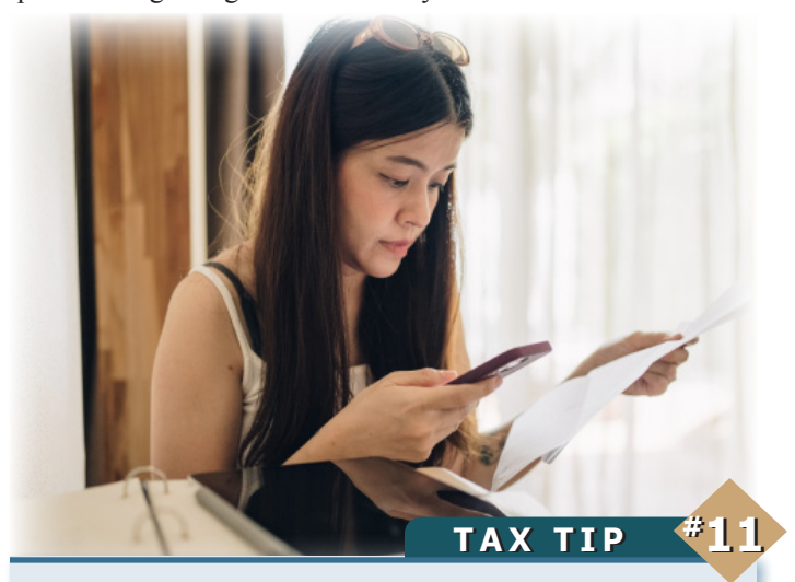
Be scrupulous about maintaining expense records when using your home office as tax deduction.

To make the most of your opportunities, contact us with any questions regarding deductions for your home.