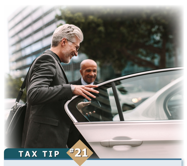
If traveling for business, many expenses are deductible. Be certain that they are reasonable and you document the date, place, and amount of the expense. In addition, substantial business discussion must take place.