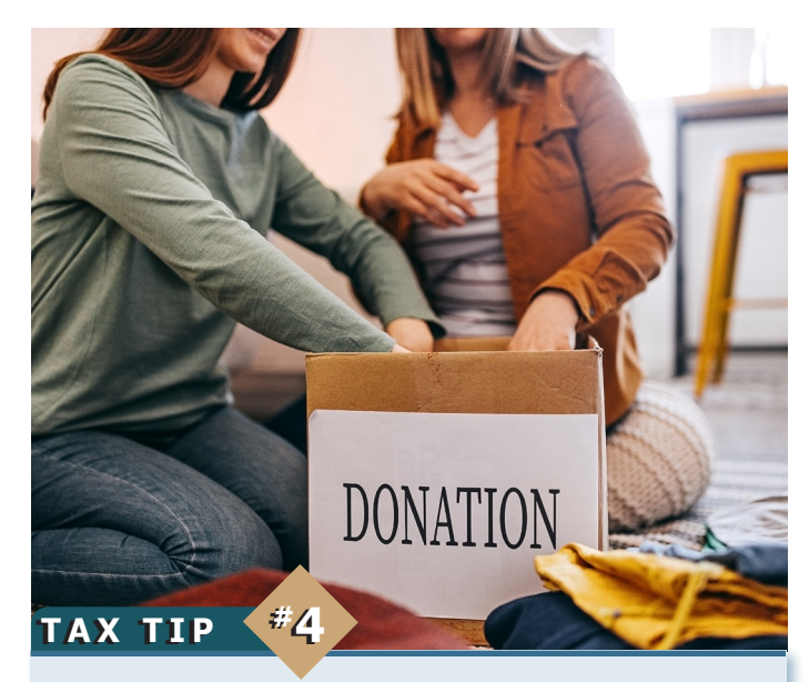
The Federal Tax Code encourages charitable contributions. After age 70 ½ you may make a direct transfer from your IRA of up to $100,000 (limited to 30% of AGI).

Student Loan Interest. Up to $2,500 of interest on student loans incurred during the year may be deducted. Since this is an "above-the-line" deduction, even non-itemizing taxpayers benefit. The loans must be used for qualified higher education expenses, such as tuition, fees, room, board, and books. If you are in a higher tax bracket, you may not be eligible for this deduction because of the phaseout rules. For more information, see the chart on page 11.